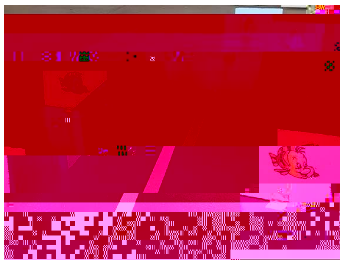
Figure 4 - Position of walls